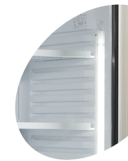
Vertical internal light