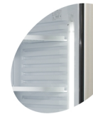
Vertical internal light