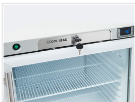
Main switch, digital thermostat and door lock fitted as standard