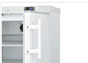
External cylindric handle in stainless steel (Steel color for X Version)