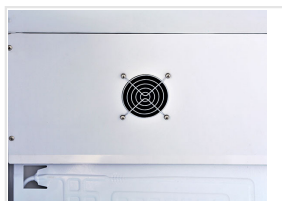
Inner assistance fan