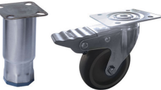
The items can be supplied either with adjustable feet or lockable castor