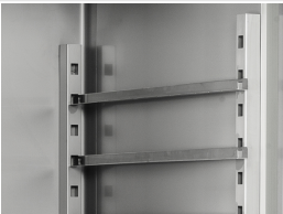
Euronorm 600x400mm set of guides (10 Layer for each door)