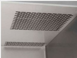
Increased internal air-flow