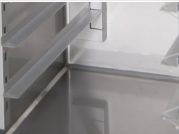
Curved edge for easy cleaning