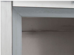
Anti-condensation "thermal-braker" on door frame