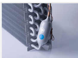
Evaporator with anti-corrosion treatment