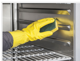
Inner AISI 304 waved guides