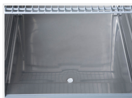
Bottom hole for easily clean and dry the item