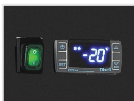
Main switch and digital thermostat fitted as standard