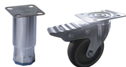
The items can be supplied either with adjustable feet or lockable castor