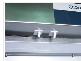
"Door opening and Hi temperature alarm" as standard