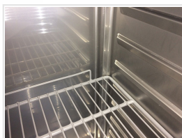
Embossed rear shelf-stopper