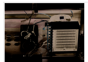
Sliding engine easy to pull out for manageable after sales servicing