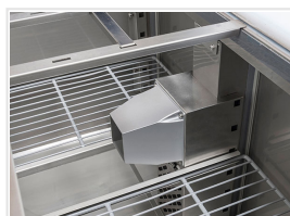
Inner assistance fan