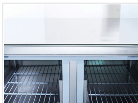
Anti-condensation thermal-braker on door frame