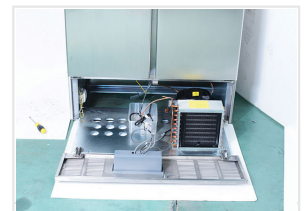
Sliding engine easy to pull out for manageable after sales servicing