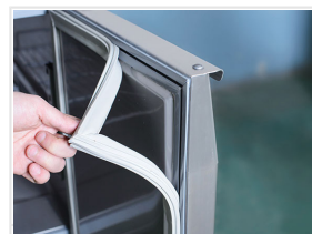
Inner embossed door design for a better sealing