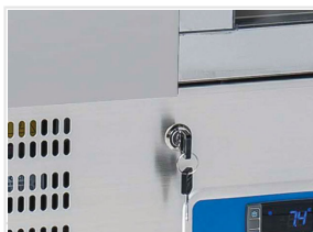
Engine room lock fitted as standard