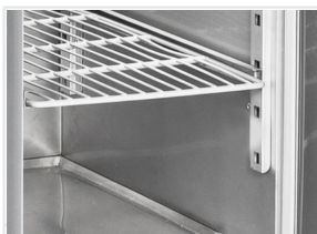
Curved edge for easy cleaning