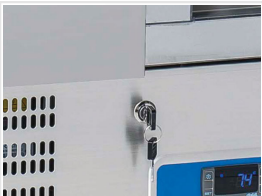
Engine room lock fitted as standard