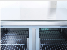
Anti-condensation thermal-braker on door frame