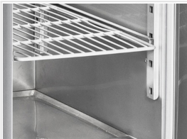
Curved edge for easy cleaning