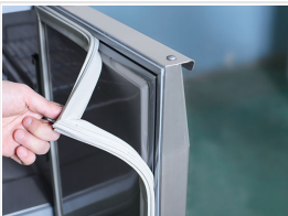
Inner embossed door design for a better sealing