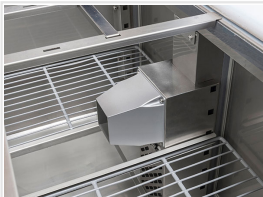
Inner assistance fan