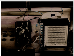
Sliding engine easy to pull out for manageable after sales servicing