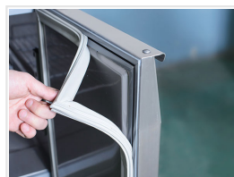
Inner embossed door design for a better sealing