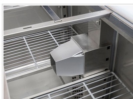
Inner assistance fan