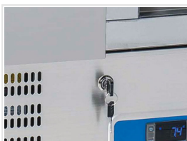
Engine room lock fitted as standard