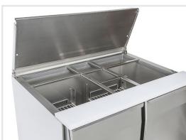
Top view of the unit